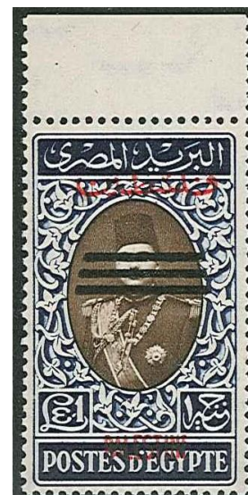
ex 182 (Gaza)