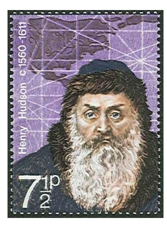
318 (missing gold)