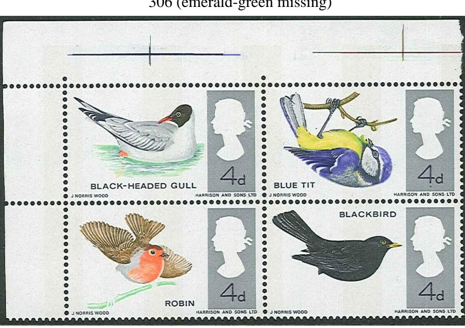
307 (red-brown missing)