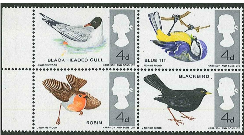
306 (emerald-green missing)