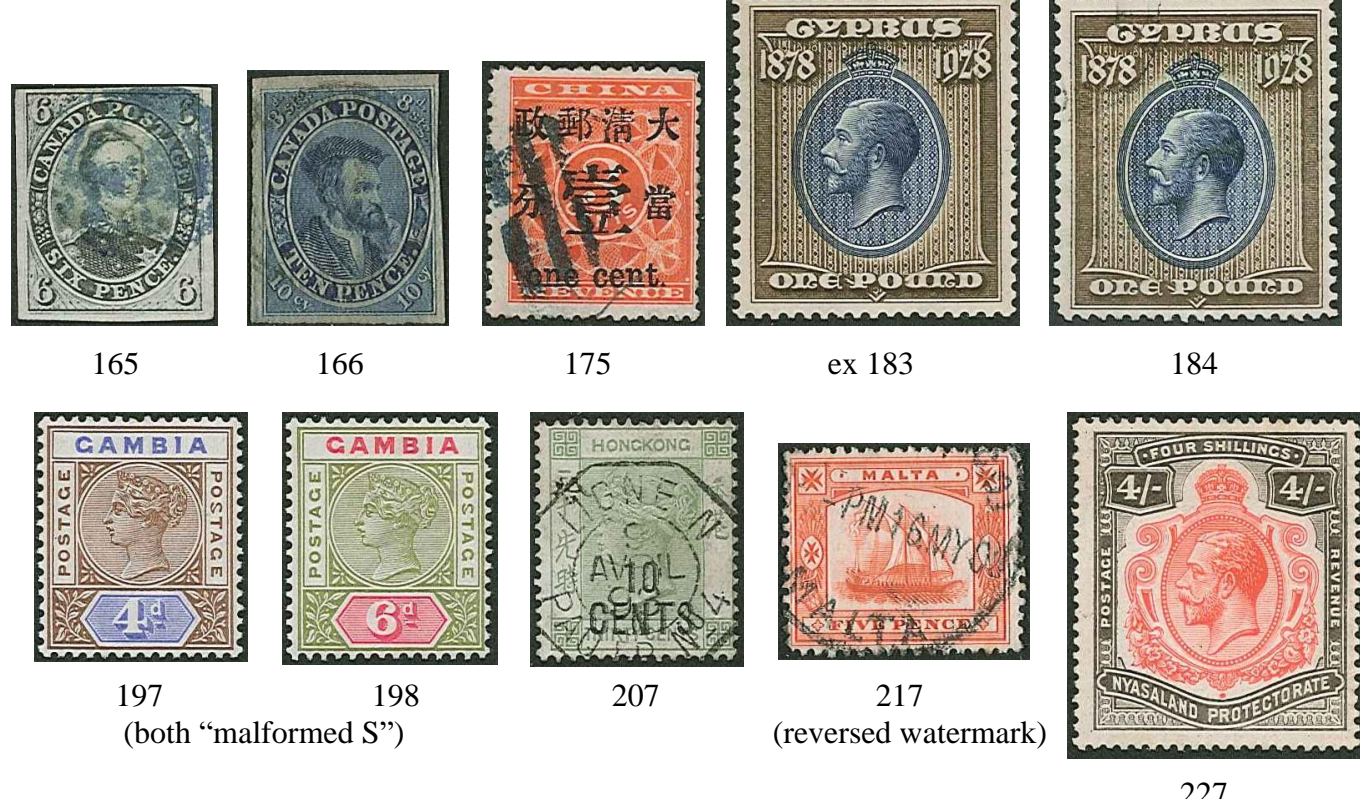
227 ("bullet holes" variety)