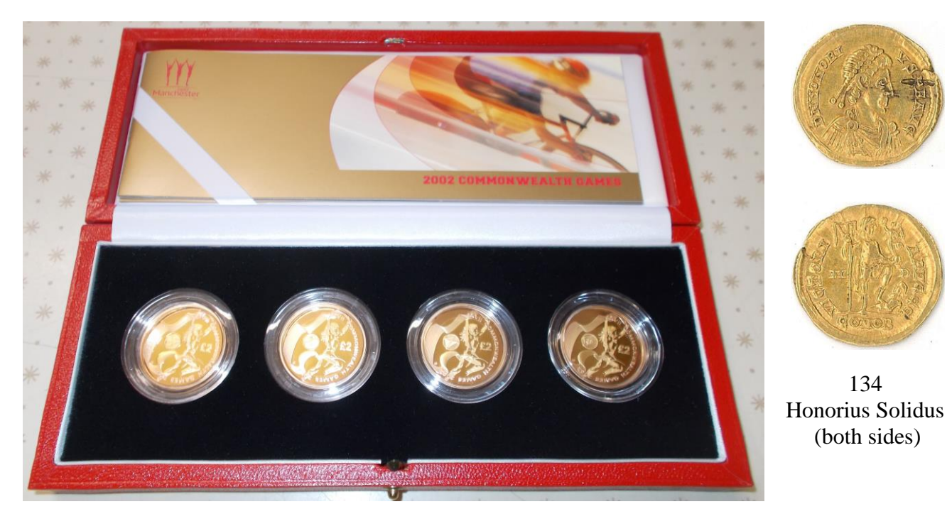
132 – Gold Proof £2 set