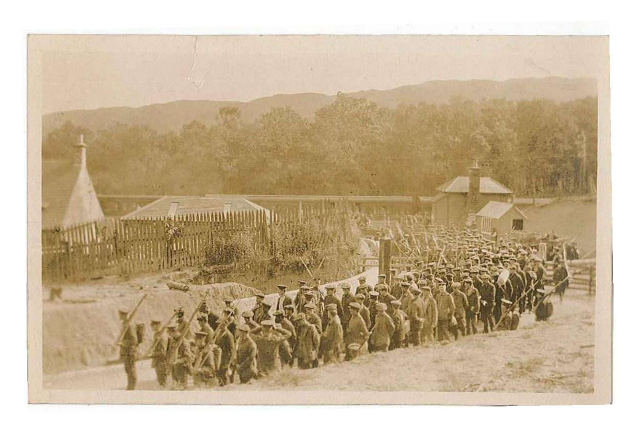
ex 168 (German Prisoners of War arriving at Stobs Station)