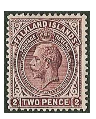
222 (scarce perforation/shade variety)