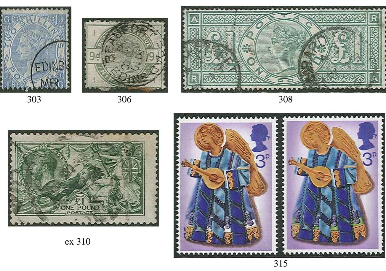
(left stamp = bright green omitted)